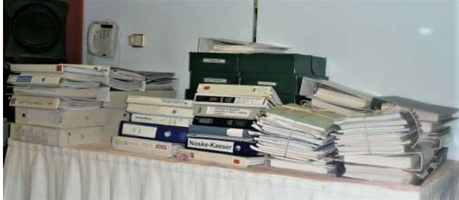
2008 Shipdex presentation in Limassol

Here below the very first reason SHIPDEX was developed: avoiding old style technical manuals.